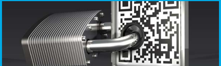
Use QR codes to garner new business with security second only to the NSA.