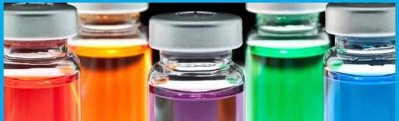
Need-to-know information for thousands of medications.