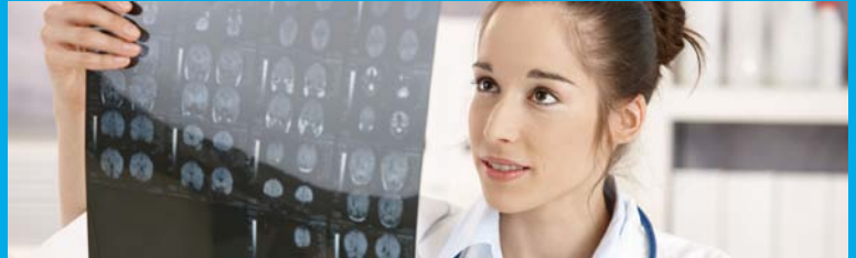
Access rationale and results for tests as well as patient care information.