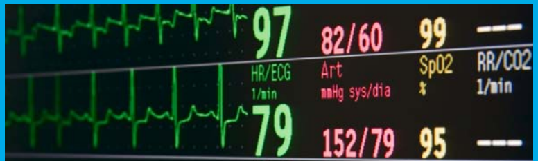
Automate the managing, tracking and verifying.